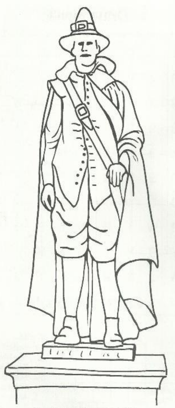
This is a statue honoring