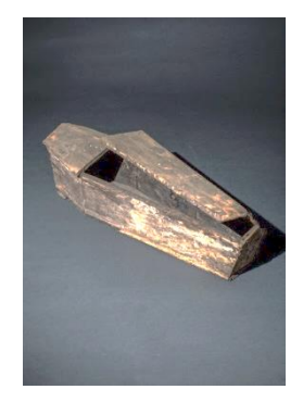
Unearthed Colonial American Coffin; Smithsonian Museum

Three things were required for a "decent burial", something often specified in wills. They were a coffin, a winding sheet, and a grave. Substantial sums were spent on alcohol for funerals. Contrary to what one might imagine, few if any, headstones remain from early